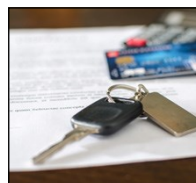
Vehicle Sales and Finance

4032 W. Beltline Blvd Columbia, SC 29204